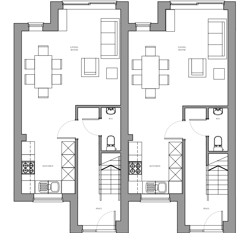
THE GALTON GROUND FLOOR