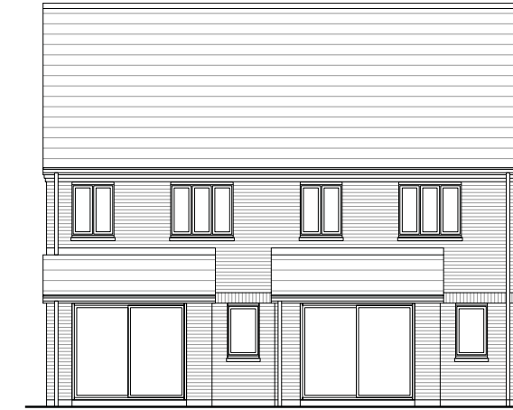
THE GALTON REAR ELEVATION