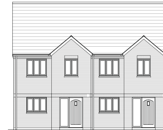
THE GALTON FRONT ELEVATION