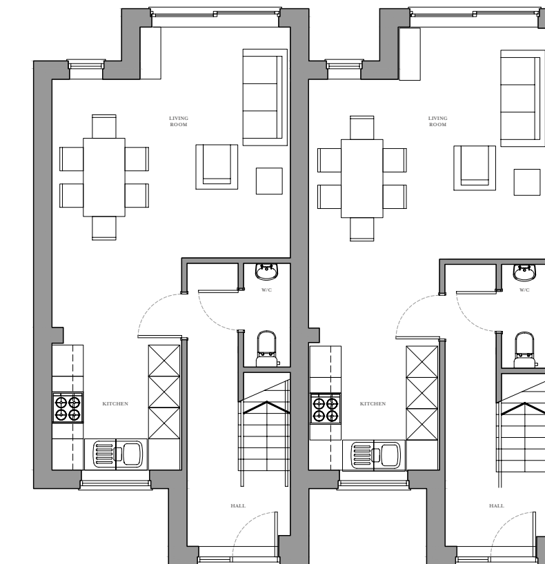
THE MOSELEY GROUND FLOOR