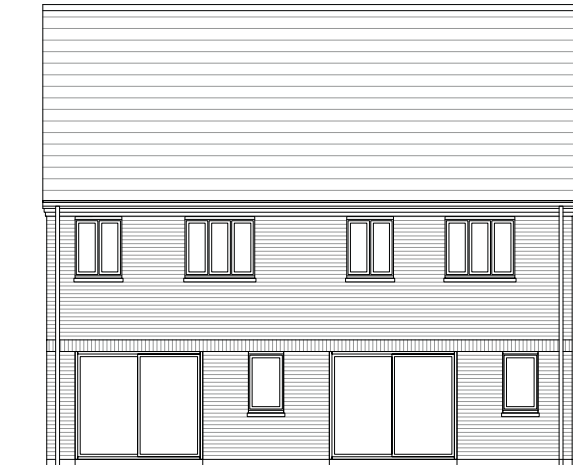
THE WARLEY REAR ELEVATION