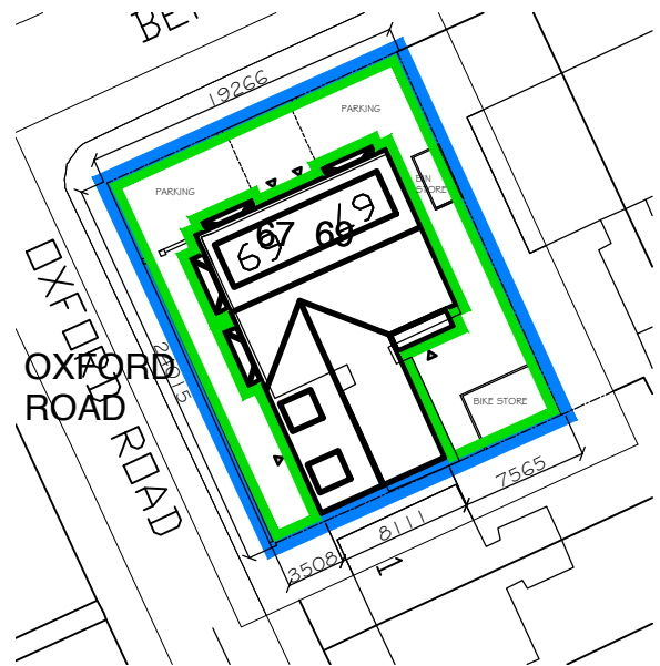
SITE DIMENSIONS SCALE 1:500