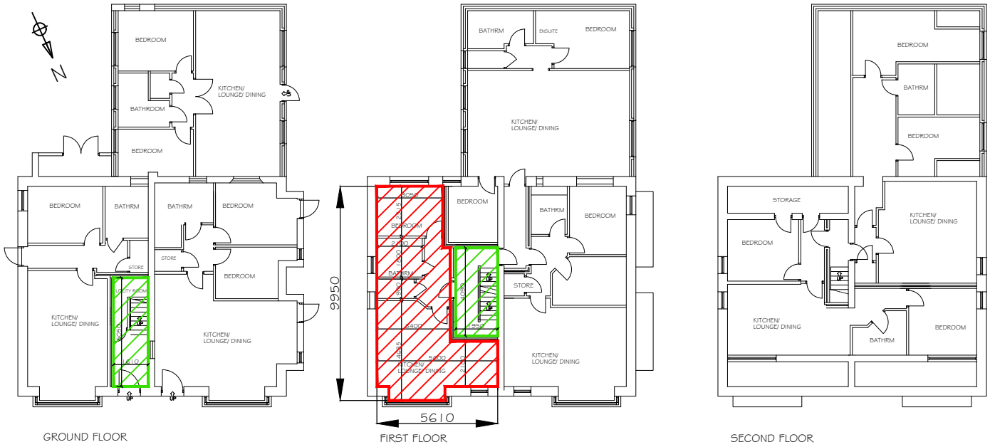
FLOOR PLANS SCALE 1:250