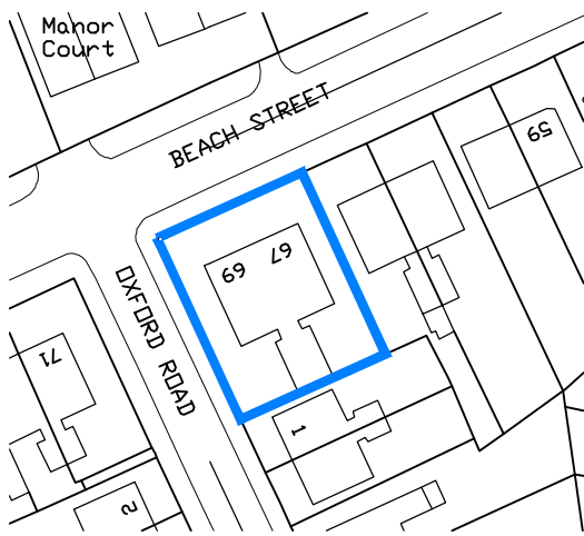
SITE LOCATION SCALE 1:1000